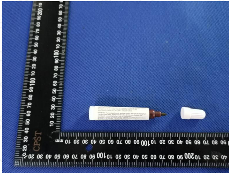
Photo of the Submitted Sample